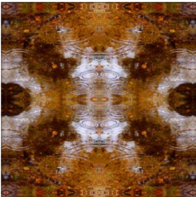
Water rings 102305

Sacred Geometry is an ancient science and a key to understanding the way the universe is designed. It is a "map" of the step-by-step movement of energy into matter creating the physical world, as we know it. It is the "language" of creation that exists at the foundation of all life revealing the basic building blocks of our universe!